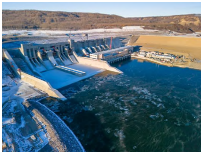
Spillways, Powerhouse and Tailrace