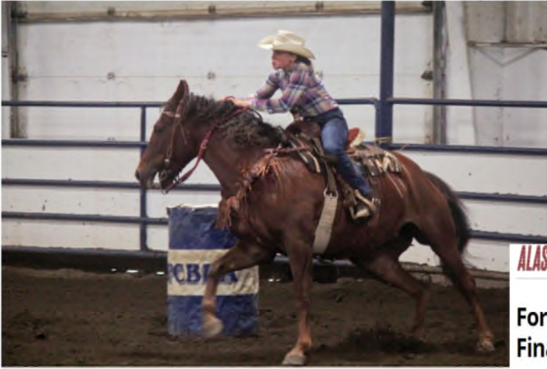
Over 200 competitors in three age categories competed last weekend in the Peace Country Barrel Racing Association Chetwynd Finals. The weekend paid out over $30,000 cash and over $20,000 in prizes including six trophy saddles.