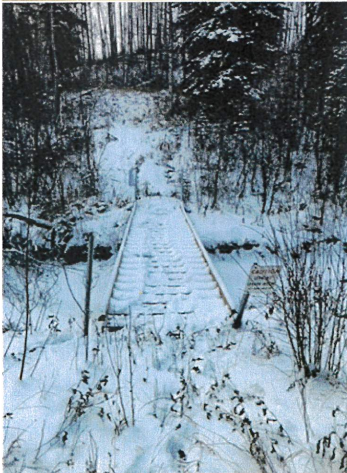
What the bridges looked like