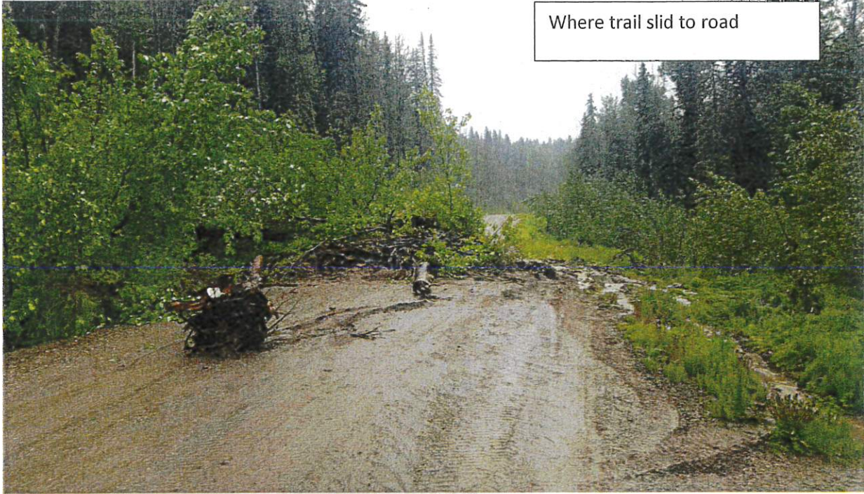
Where trail slid to road