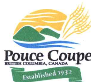
Village of Pouce Coupe