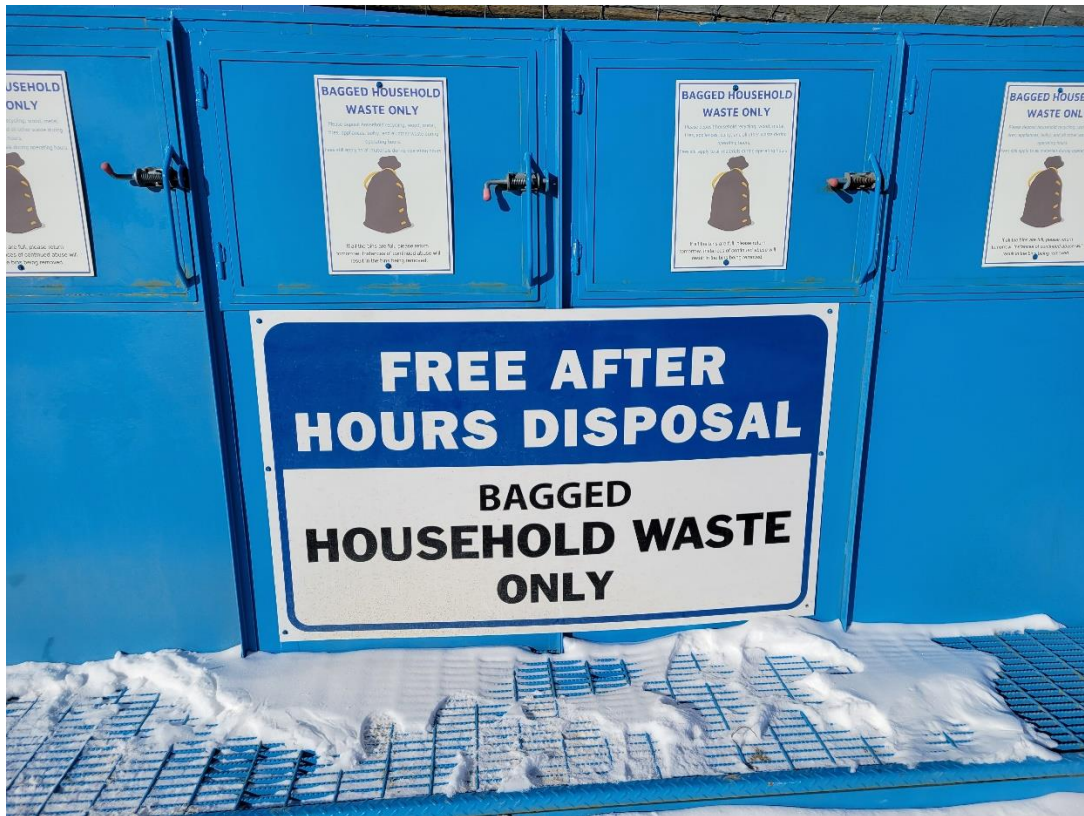
Figure 1. After-Hours Bin and Signage

There are numerous messaging signs on the after-hours bins that display what types of waste materials are accepted. Figure 1 below shows what messaging is placed on the bins.