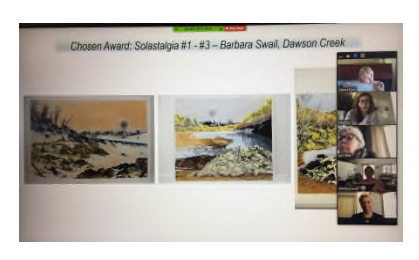
Artist Walk-Through Via Zoom Artist Talks on YouTube